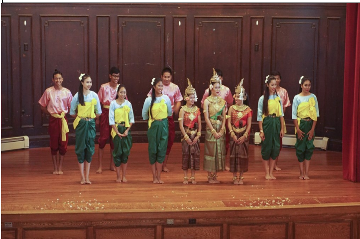
The Angkor Dance Troupe performing traditional Cambodian dance.

This performance was one of three multi-cultural intergenerational programs presented by the library through a generous donation from Digital Federal Credit Union. The other programs presented as part of this series were Joy of Samba (Brazilian Drumming) and the Akwaaba West African Drumming Ensemble.