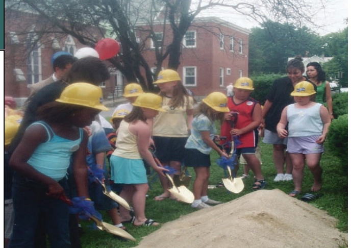
Library Groundbreaking Ceremony "Kids Dig"