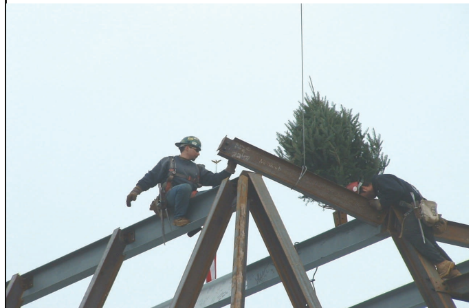
Library "Topping Off" Ceremony January 11, 2006