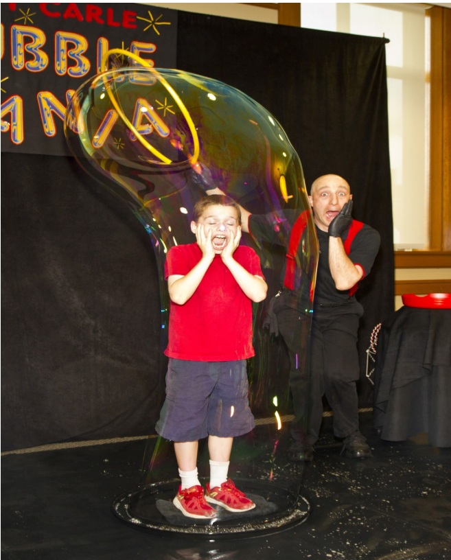
Tons of fun at the 6th Annual Celebration of the Dr. Martin T. Feldman Children's Room