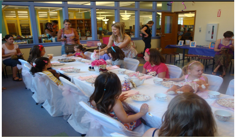
TEA PARTY AT THE LIBRARY