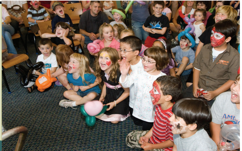
Children are entertained by a magician during the dedication celebration of the Dr. Martin T. Feldman Children’s Room

The students and teachers at Baoan Middle School in Shenzhen, China