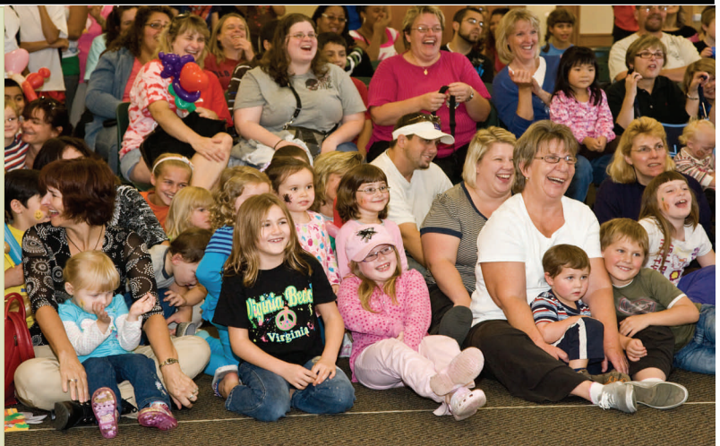
All ages enjoy programs at the Leominster Public Library!

"Fewer kids and teens don't use their libraries? At least not in my city. I live in Leominster, and as soon as school ends here at 2:15 a whole bunch of kids from LHS go directly from the school to the library, including me. I find it insulting to hear something so crazy as 'maybe fewer kids are using the library.' Whether for school work, or quiet time, or to pick up a book, or maybe even to hang out in the young adult center, the library is my release from the world around me and if it closed I would probably cry."