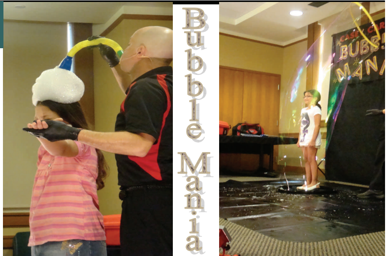
Meeting Room Use