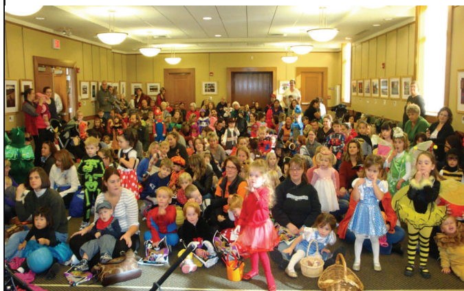
Musical program kicks off Tiny Tots Trick or Treat